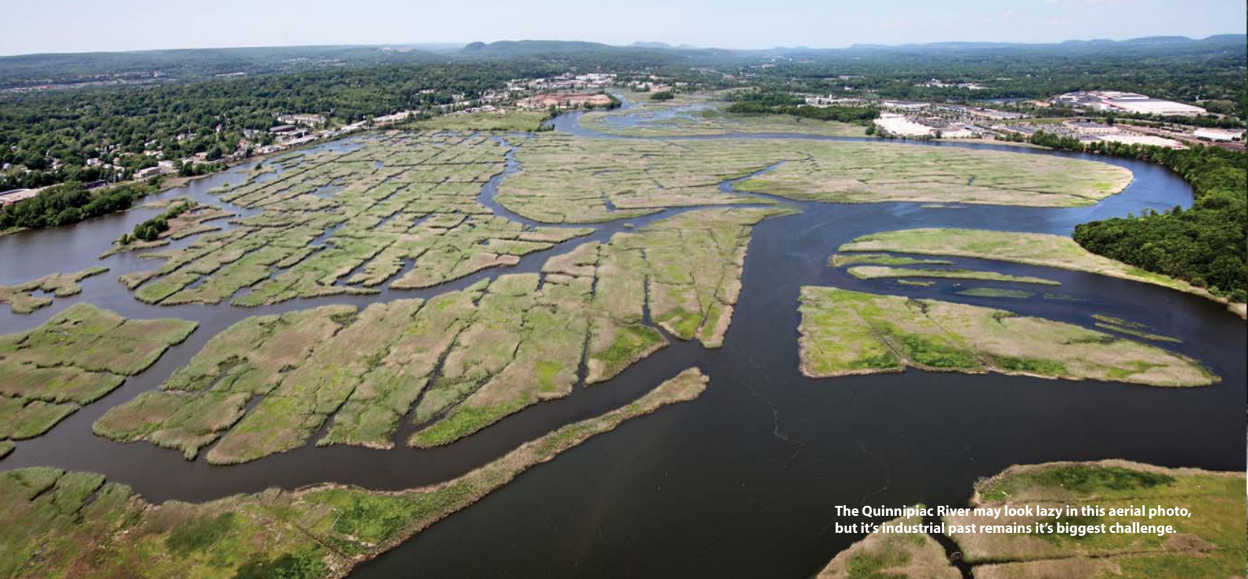
The Quinnipiac River may look lazy in this aerial photo, but it's industrial past remains it's biggest challenge.