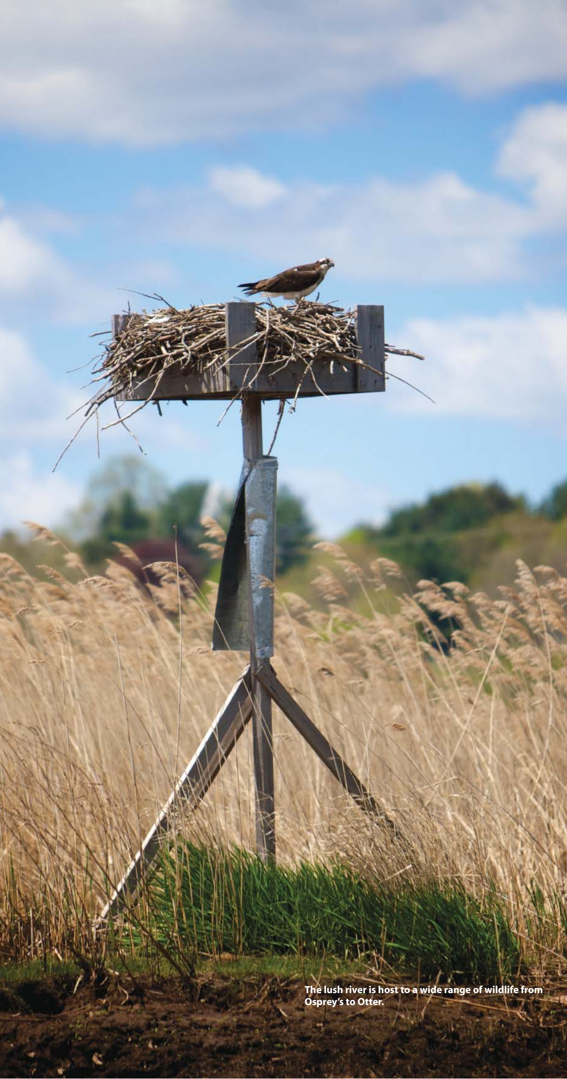
The lush river is host to a wide range of wildlife from Osprey's to Otter.

“I live along it, I’ve rescued people from it, I’ve traversed the entire length of it and I love it,” he says.