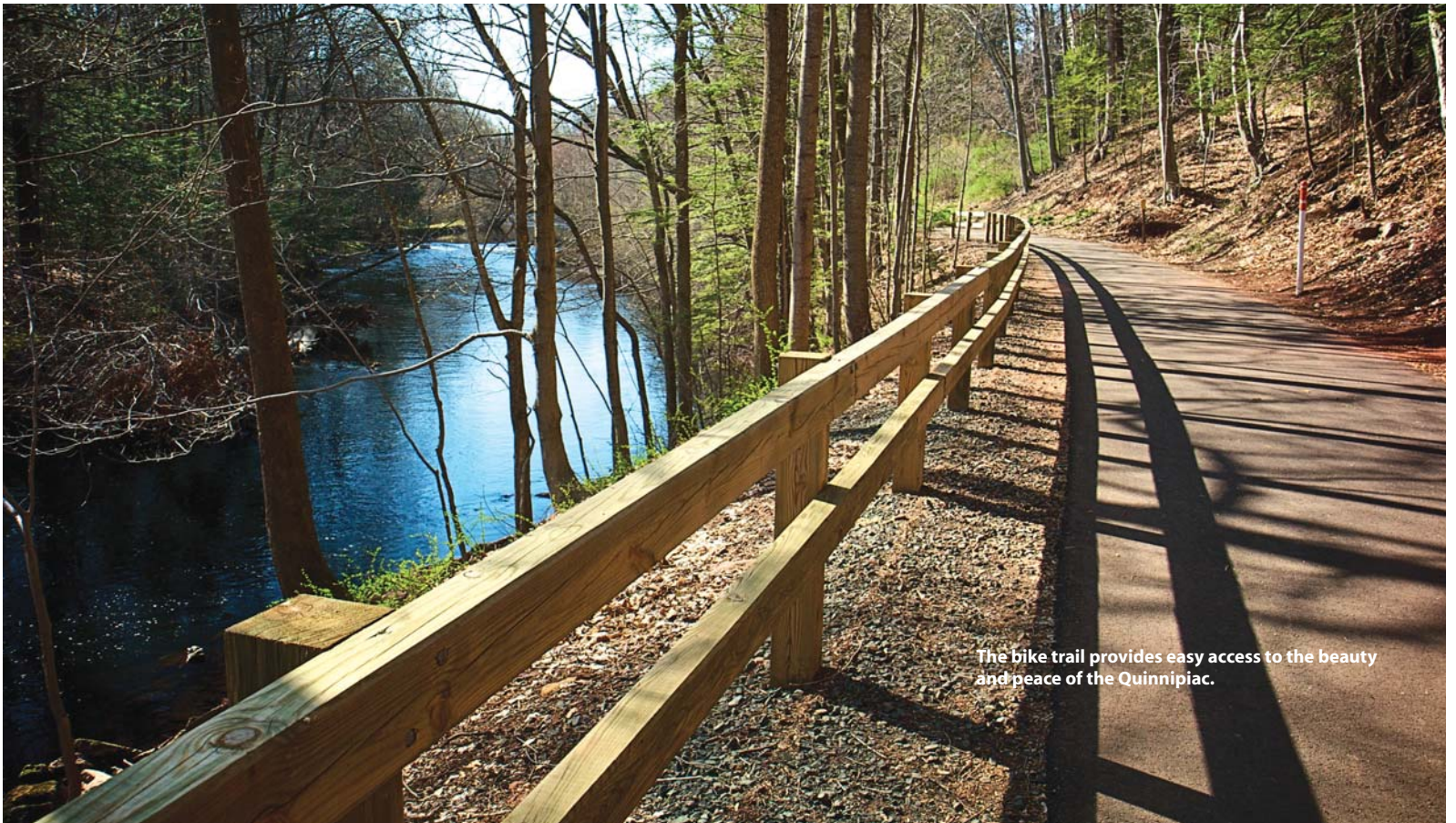
The bike trail provides easy access to the beauty and peace of the Quinnipiac.